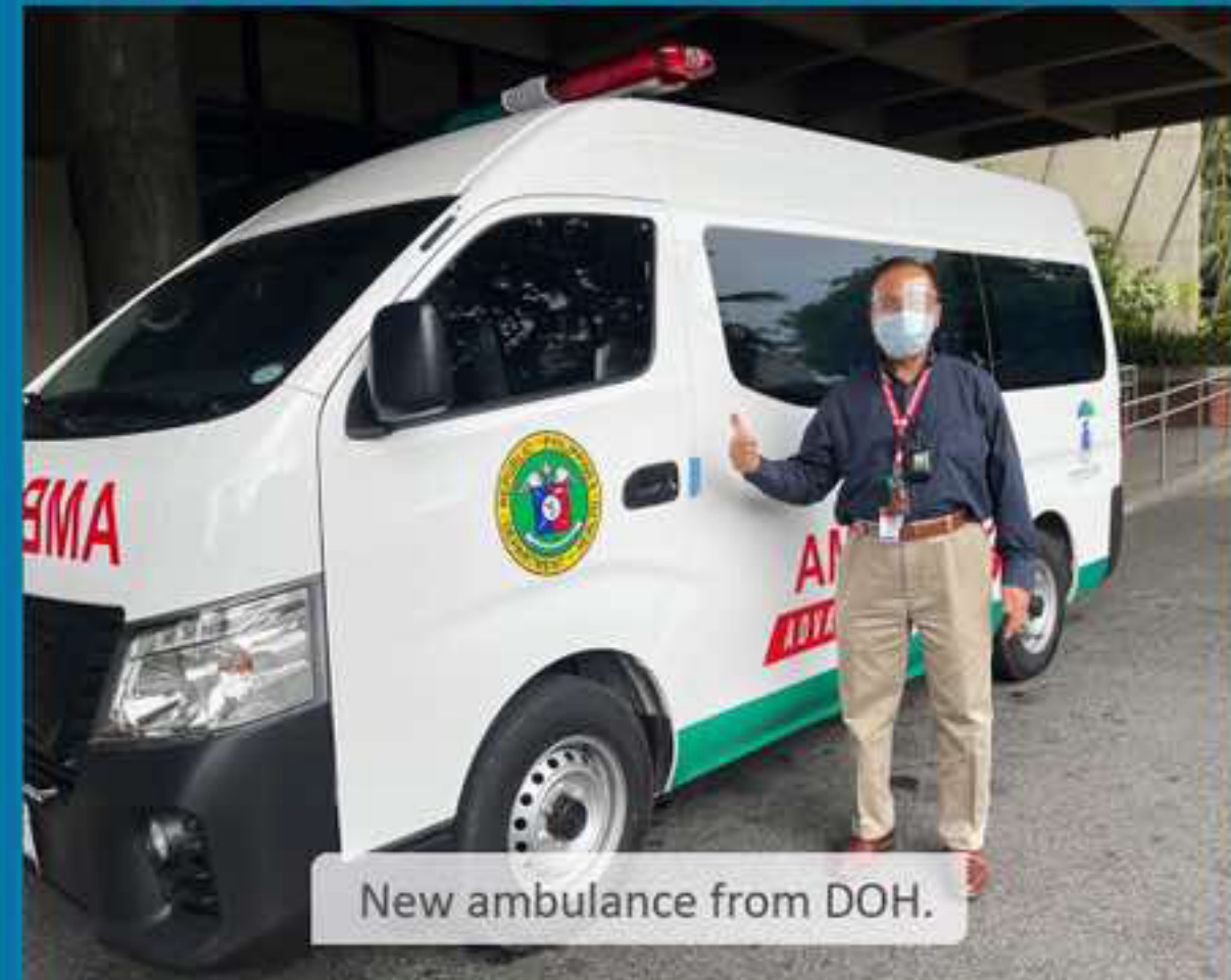
New ambulance from DOH.