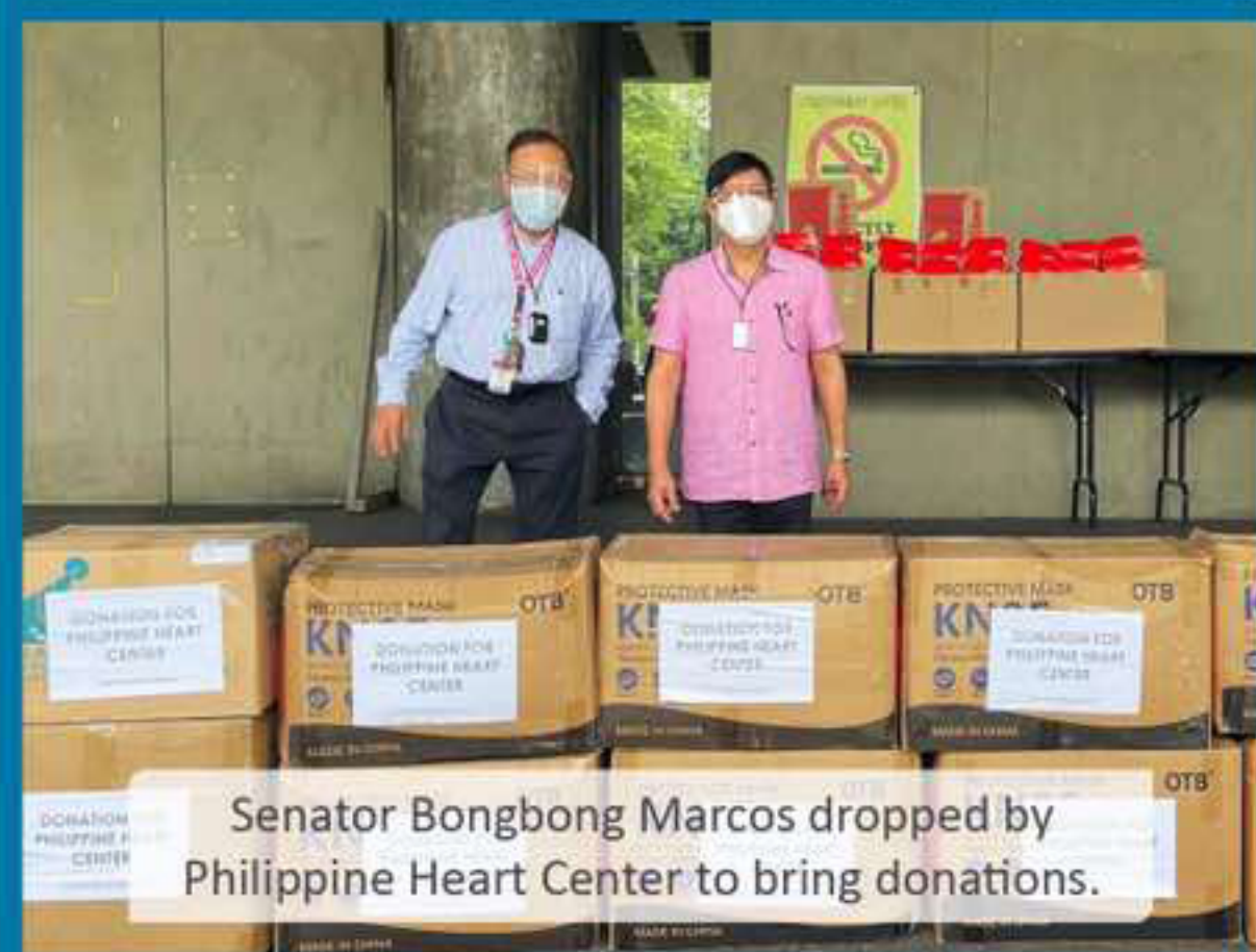
Senator Bongbong Marcos dropped by Philippine Heart Center to bring donations.